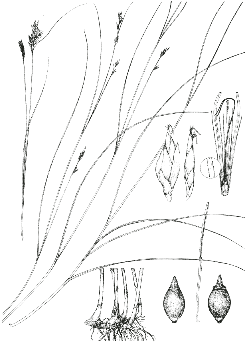
Fig. 2. Rhynchospora jaliscensis (Drawn by Karin Douthit, from the holotype, except for the inflorescence at upper left from McVaugh 20057). Upper portions of flowering culms, X 0.5; rhizome and bases of culms, X 1; spikelets, X 5, the scales of the one at left distended by mature achenes; flower, X 10, with portion of bristle much enlarged; achenes, X 7.5; anther and part of filament, X 10.